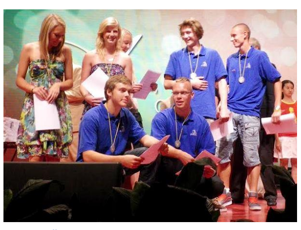
Ülenurme delegation with Coubertin Awards in Beijing 2011

On the 24th of August at 7 pm there will be a parade at the Town Hall Square of Tartu.